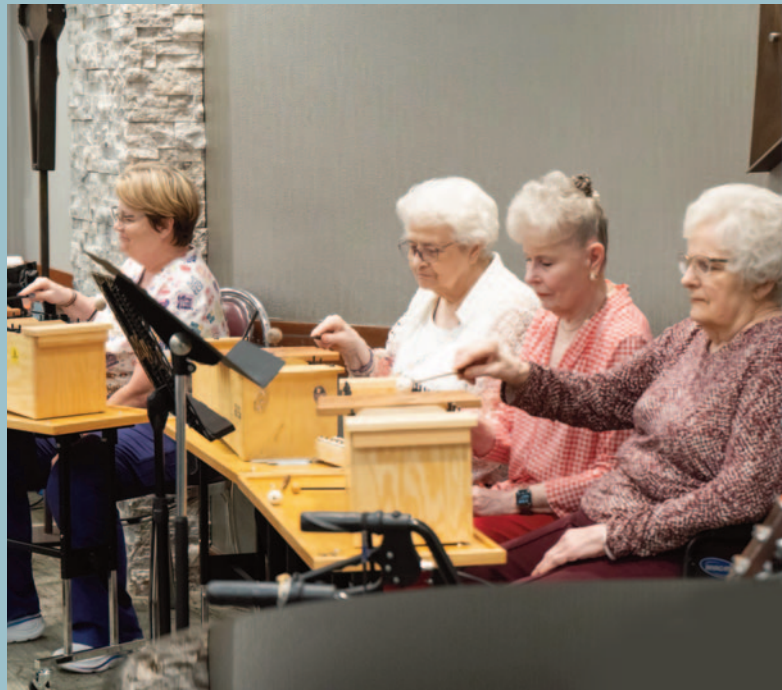
The Valley Orff Band