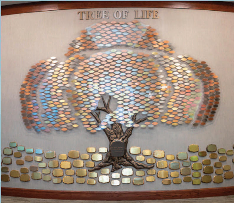
The Tree of Life at Valley on 42nd